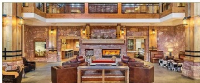
Section | 1